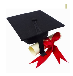
Clipart from Microsoft Office

If you cannot attend the meeting, please give your prize to another Epsilon Psi member who will be in attendance.