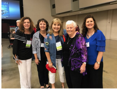
Epsilon Psi and Gamma Nu sisters