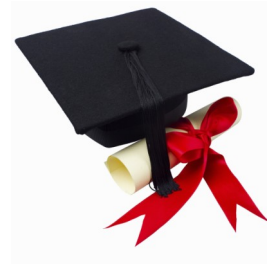
Clipart from Microsoft Office

If you cannot attend the meeting, please give your prize to another Epsilon Psi member who will be in attendance.